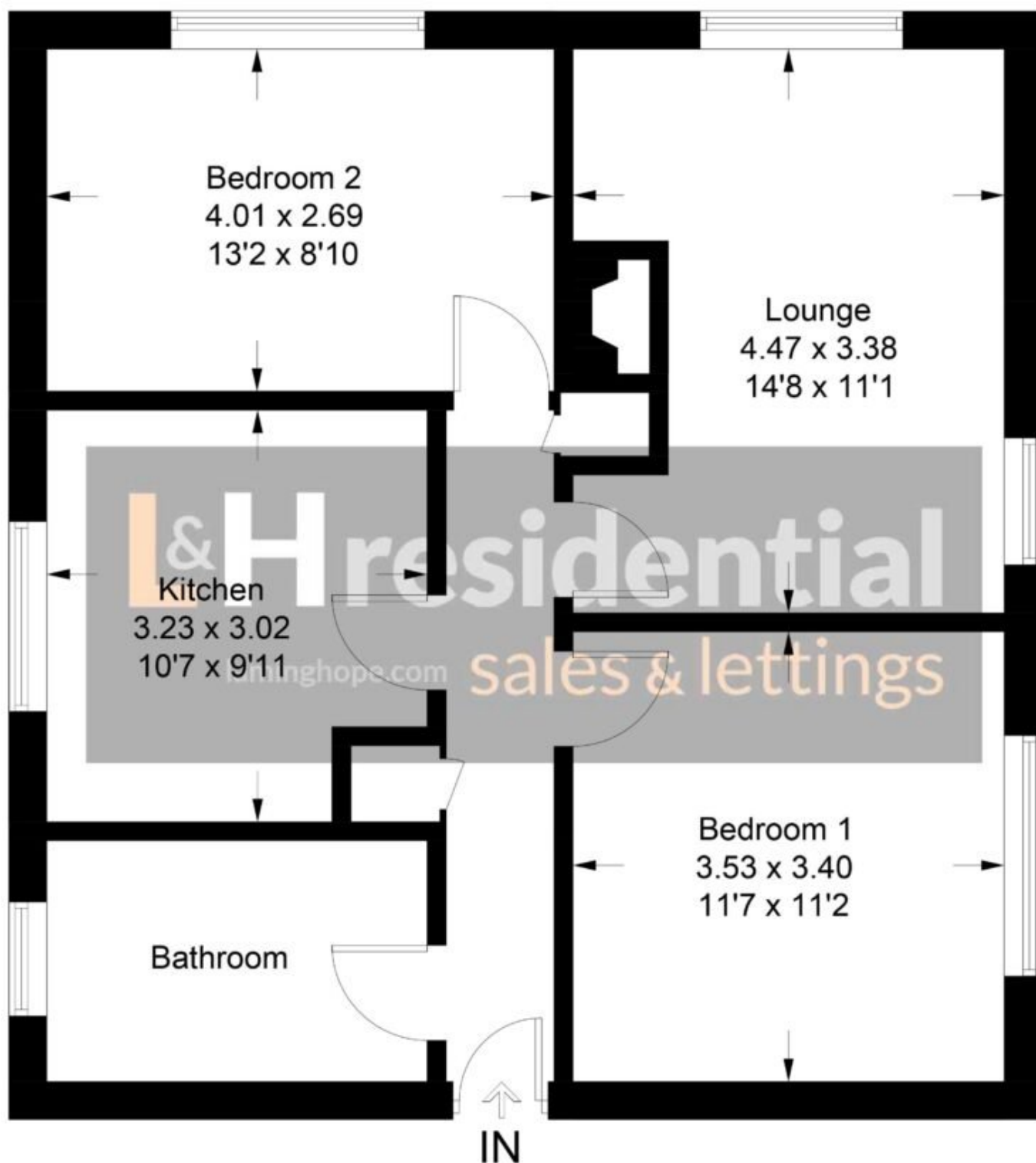
Illustration for identification purposes only, measurements are approximate, not to scale. floorplansUsketch.com © (ID877621)

Approximate Gross Internal Area = 61.6 sq m / 663 sq ft