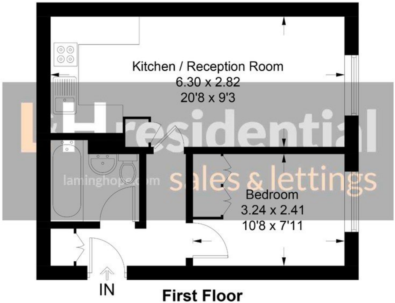
Illustration for identification purposes only, measurements are approximate, not to scale. (ID707653)