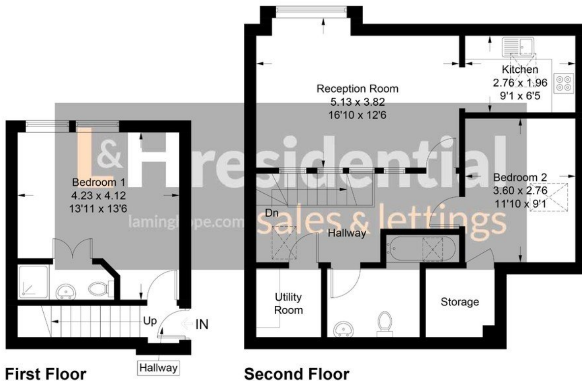
Illustration for identification purposes only, measurements are approximate, not to scale. floorplansUsketch.com © (ID693834)