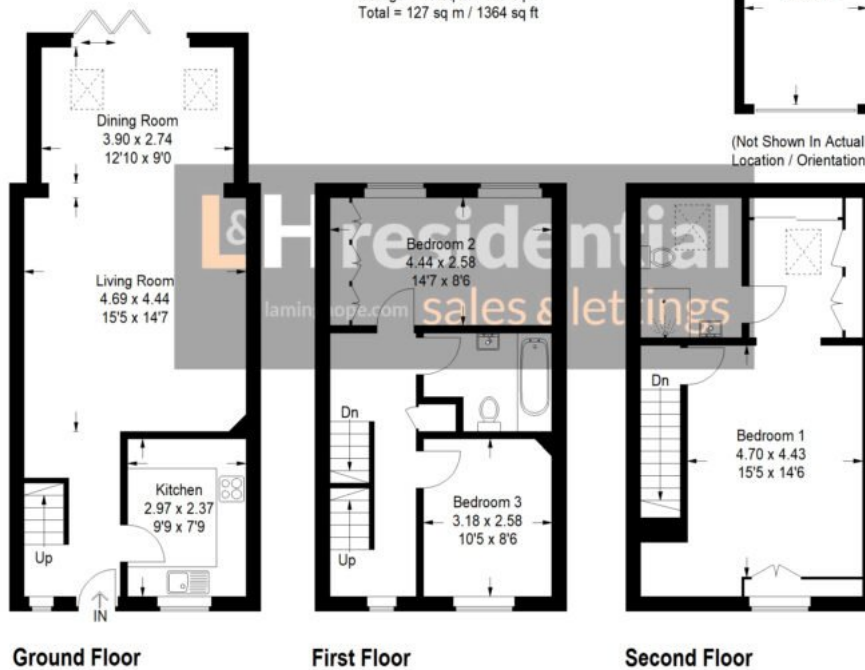
Illustration for identification purposes only, measurements are approximate, not to scale. FloorplansUsketch.com © 2021 (ID799186)

(Not Shown In Actual Location / Orientation)