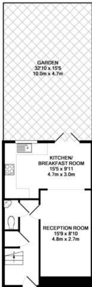
GROUND FLOOR APPROX. FLOOR AREA 34.1 SQ.M. (367 SQ.FT.)