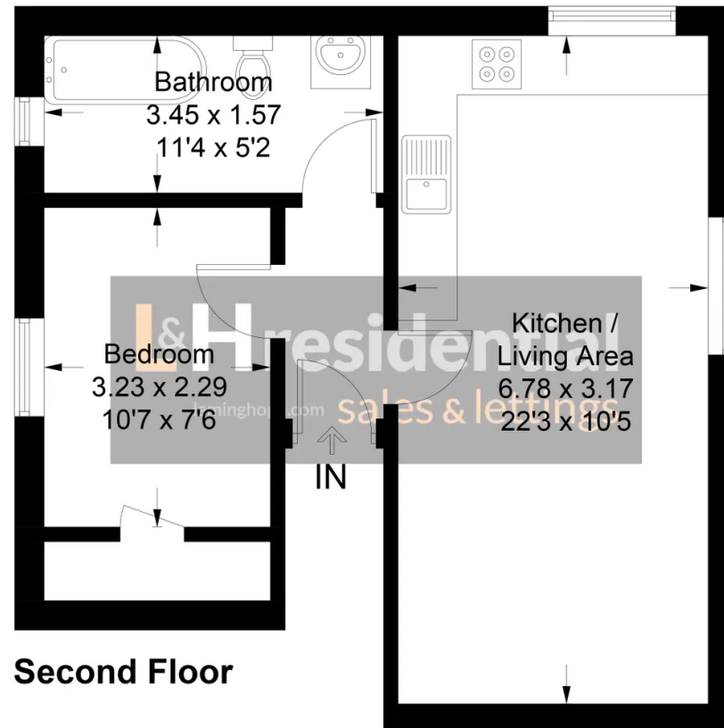
Illustration for identification purposes only, measurements are approximate, not to scale. floorplansUsketch.com © (ID611066)

Approximate Gross Internal Area = 39.8 sq m / 428 sq ft